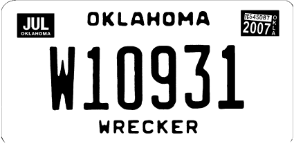
Metal Wrecker License Plate Figure 3