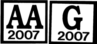
Wrecker Sticker Figure 2